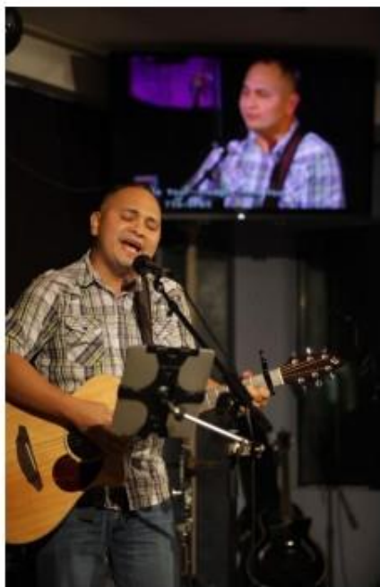
Live entertainment by local musicians at KGTF telethon...

At the invitation of Guampedia , PBS Guam was set to cover the proceedings of Pacific History Conference 2015 on Saipan in late August, but the event was cancelled due to that island's continuing recovery from Typhoon Soudelor. PBS Guam will be covering the 2016 Conference at the University of Guam in the four days immediately preceding the Festival of Pacific Arts in May.