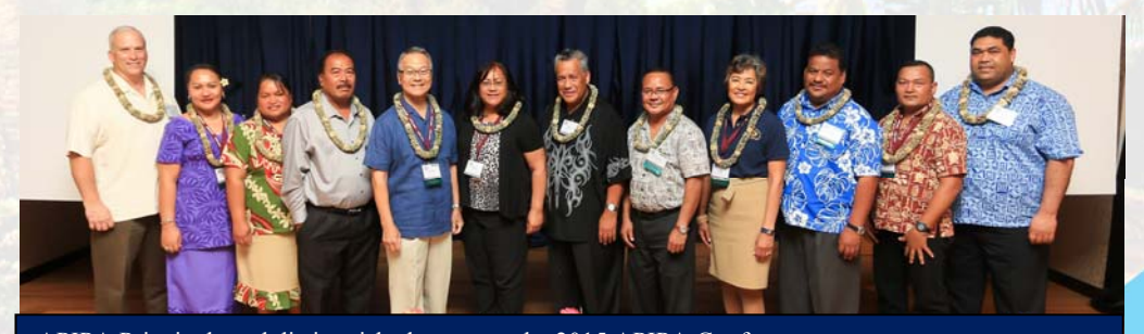
APIPA Principals and distinguished guests at the 2015 APIPA Conference.

We were pleased to host the 26<sup>th</sup> Annual Association of Pacific Islands Public Auditors (APIPA) Conference in August 2015. Auditors and finance officers throughout Guam and Micronesia received valuable continuing professional education to help improve accountability and transparency and achieve good governance. The conference offered a wide range of ideas and courses, such as Audit, Government Finance, Grants Management, Leadership, and other courses to help professionals support and provide extended services to their organizations.