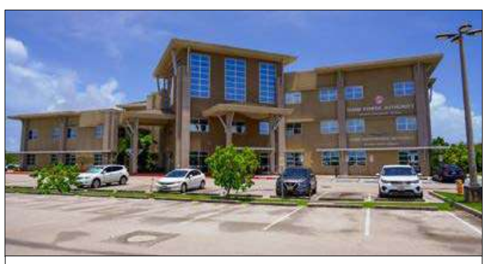
Figure 1: The GPA and the GWA main offices are housed under the Gloria B. Nelson Public Service Building in Mangilao, Guam.

In December 2008, the Consolidated Commission on Utilities (CCU) adopted Resolution No. 2008-37 to authorize the GPA and the GWA to establish their own credit card policy. The CCU recognized that both entities had needs to purchase items online or over the phone where expediency required the use of a credit card. The GPA General Manager (GM) and the GM for Consolidated Utility Services determined that a policy would need to be developed to control the use of credit cards.