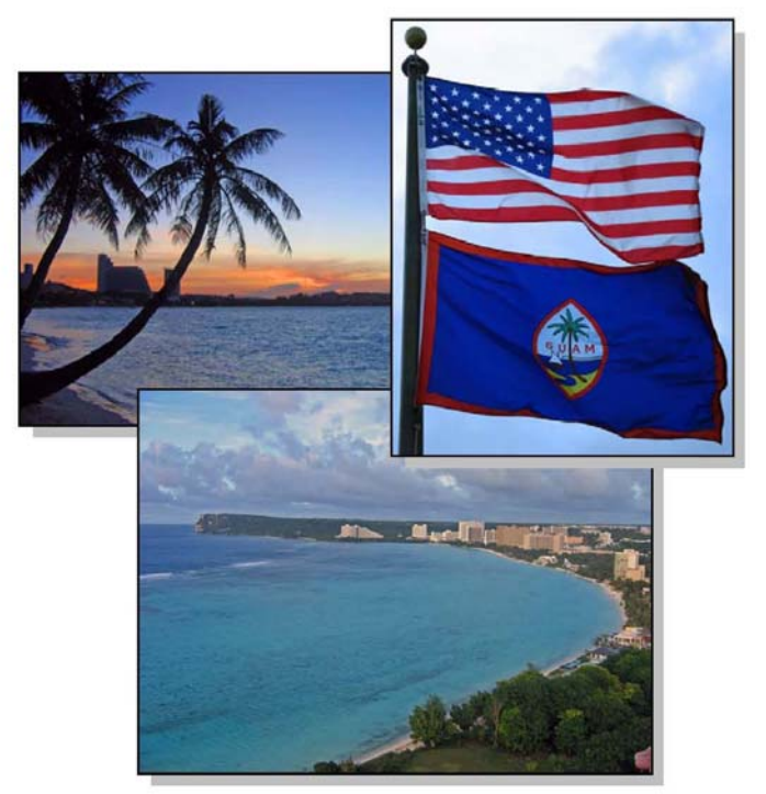
Guam's Tax Collection Activities:

Office of Insular Affairs Involvement Needed to Achieve Lasting Improvements