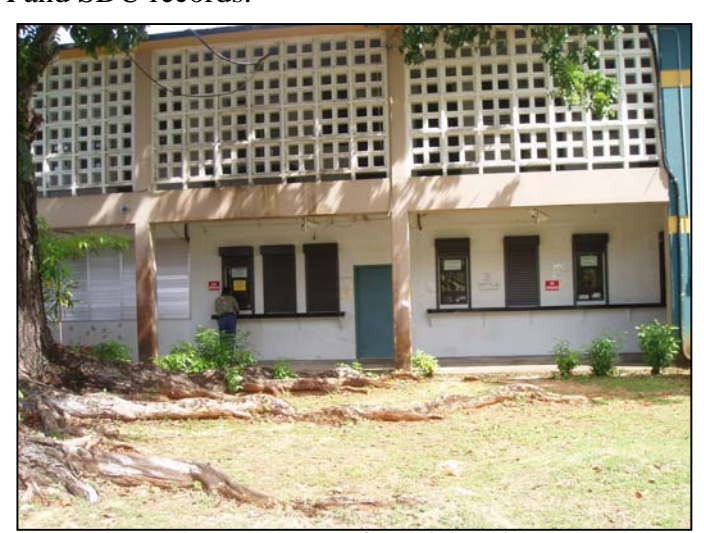
The Department of Administration.

Of the 17 recommendations made in the prior audit, eight were implemented, four were partially implemented, three were not implemented, and two were