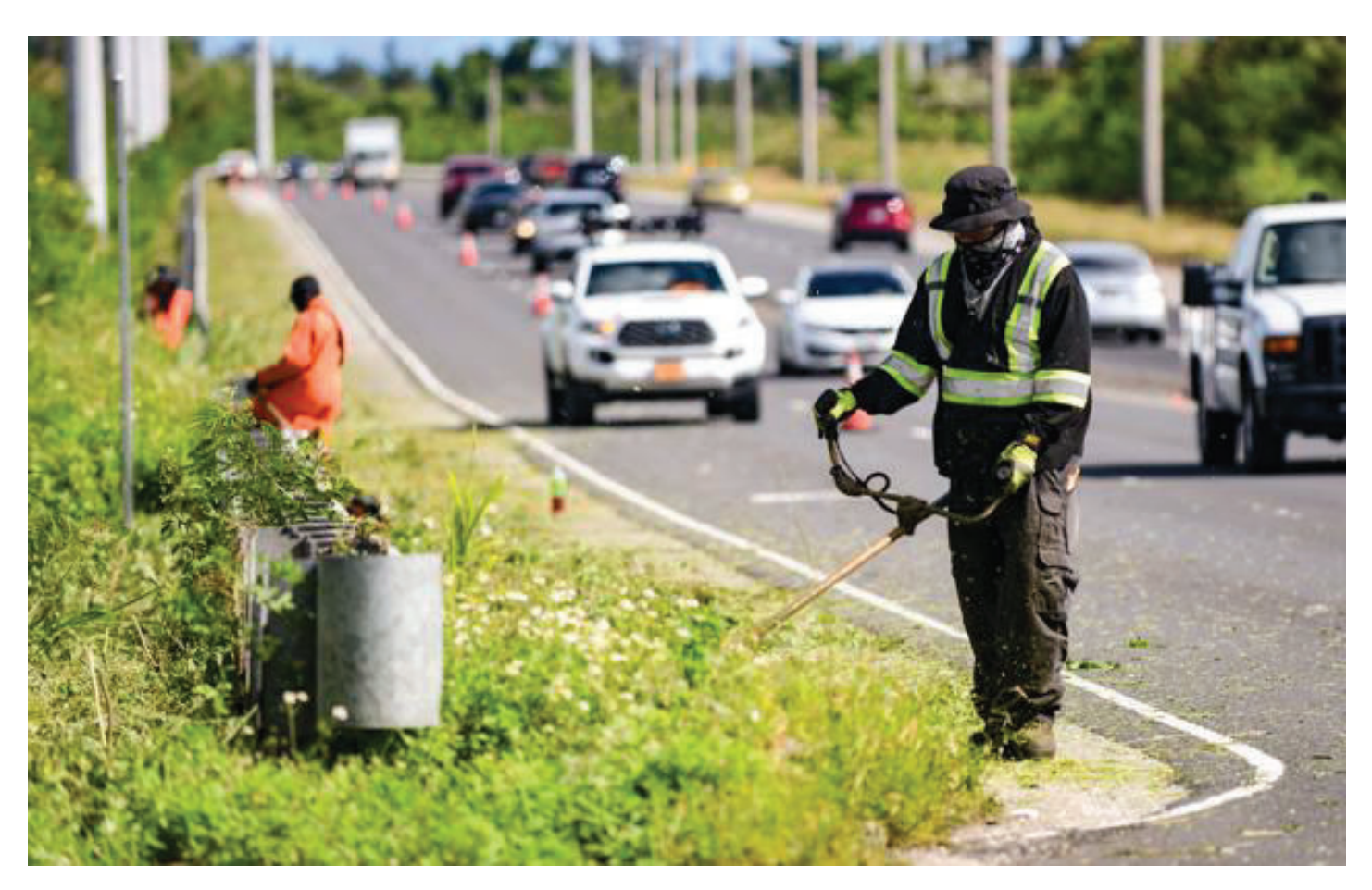
Department of Public Works employees clear overgrowth from safety railings along Route 16 in Barrrigada on Dec. 13, 2023.