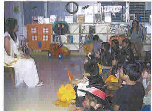
Special Story Hour at the Barrigada Library