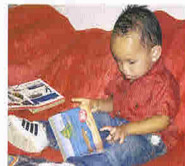
You are never too young to read!

SATURDAY STORY HOUR EVERY SATURDAY! CALL (671) 475-4751 or 475-4752 SEE YOU AT YOUR LIBRARY!!!