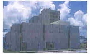
Nieves M. Flores Memorial Library