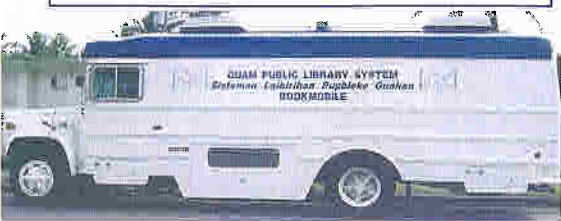
The Guam Public Library System Bookmobile

Bring your family or a friend and come see what we do every Saturday, every month at the N. M. Flores Memorial Public Library in Hagåtña. At 10:00 a.m. there will be Storytelling and then at 11:00 a.m., we have Arts & Crafts for the children to enjoy! CALL (671) 475-4751 or 475-4752 for details.