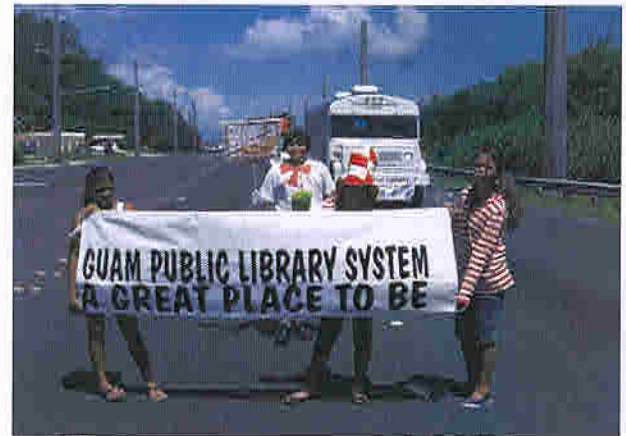
GPLS family members helping out at the Guam Liberation Parade