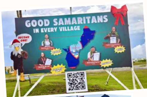
DOUGLAS B. MOYLAN ATTORNEY GENERAL OF GUAM

Looking forward, we will continue to grow our presence and services we provide in all possible ways to better help you. I remain grateful for your allowing me to serve as your elected Attorney General and commit to continuing the work that needs to get done to keep our people safe and to protect the public interest.