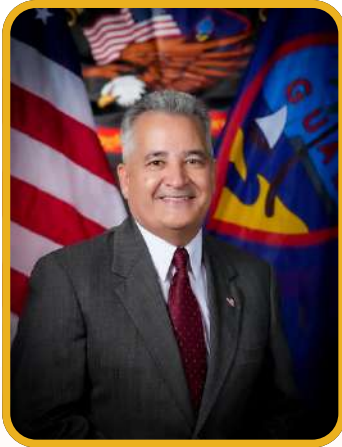
DOUGLAS B. MOYLAN ATTORNEY GENERAL OF GUAM