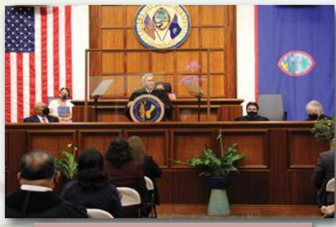
2021 State of the Judiciary Address

The Judiciary's Fiscal Year 2023 appropriation request was designed to reasonably satisfy our financial needs in providing a sufficient workforce to support our operations and services, including electronic monitoring for appropriate defendants. The budget request will provide funding necessary to address proposed workforce increases to compensation. These increases are required to ensure that the Judiciary meets its statutory mandate to provide a compensation package that provides for internal equity and external competitiveness. On a daily basis, the Judiciary delivers efficient and effective services while also being a good steward of the public dollars given to it and modeling fiscal responsibility.