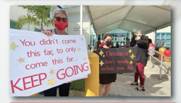
Judiciary employees hold up signs of encouragement during an Adult Drug Court graduation ceremony held on Nov. 19, 2021.

Virtual court proceedings have become the norm except for certain court proceedings that must be in-person to meet due process requirements. The Judiciary is studying whether to permanize virtual hearings for certain court proceedings and will consider feedback from all court stakeholders. The Judiciary continues to improve all levels of our physical plant and technology infrastructure. The Judiciary invests its public dollars in training its Judicial Officers and staff to maintain a high level of service to court patrons.