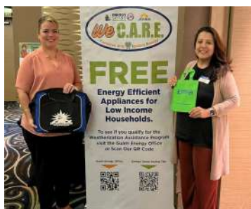
Guam Tropical Energy Code Workshop, 3/22/23, Dusit Thani Guam, Tumon