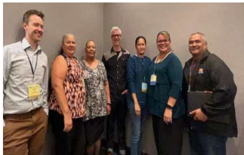
NASEO Mid-Winter Conference, USDOE & Guam WAP Team, March 2023, Arlington, VA