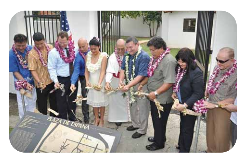
Ribbon Cutting Ceremony for the rehabilitated Plaza de España in Hagatna took place in December 2013.

GEDA's Real Property Division oversees numerous multimillion dollar projects and programs and manages two industrial parks: The E.T. Calvo Memorial Park and the Harmon Industrial Park, generating jobs and millions of dollars in revenue to the island. RPD is also charged with managing $55 million in capital improvement projects funded through the 2011 Hotel Occupancy Tax Bond (HOT Bond). These projects include the renovation and restoration of cultural and historic sites throughout the island, and include the construction of the Guam Chamorro Education Facility (Guam Museum).