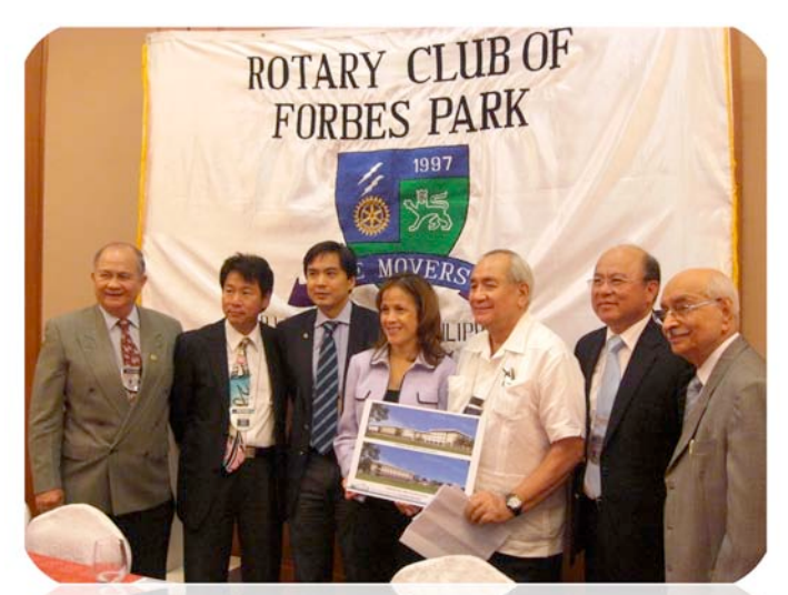
Manila (April 2010) Guam delegation meets with key members of the Filipino business community to discuss investments and Guam's expected economic potential and growth.

Regional interest in Guam continues to grow.