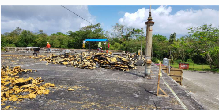
Roof Repair GEPA Building 15-6100 Tiyan