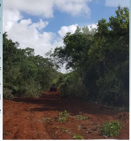
Easement Opening - GALC Crown Property Lot 2481 Radio Barrigada

Regulations. As a result, the GALC was unable to compensate original landowners who will not benefit from the return of their lands. Furthermore, the GALC continues to struggle with providing easements to returned property. This is attributed to the reluctance of property owners to dedicate a small portion of their property and the lack of authority to utilize financial resources to provide easements to returned property. In FY 2021, the GALC did not return any property, and the Commission's aggregate amount of land returned remains at 2,643.12 acres.