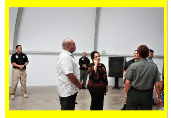
We strive to equip all inmates with the adequate skills needed to be a contributing citizen of Guam.