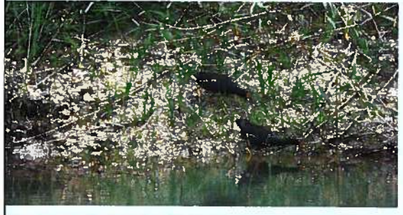
HIDDEN BEAUTY: 2 Endangered Specie Adult Moorehens caught in action. Documenting Moorhen occurrences and breeding status on 28 sites throughout Guam; island-wide census was completed in June and will be repeated in September.

Protection Program managed by the Forestry & Soil Resources Division (FSRD) have a reported 3,861 burned acreage, ~2.8% of total island area. Continued Partnerships have allowed target that have an impact enhancements of native forest impacts and ongoing resources of Guam. In outreach and education. Efforts to screen and pre-