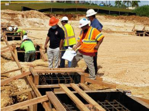
CFMO Team at site assessment at Barrigada Readiness Complex. (Feb 2020)