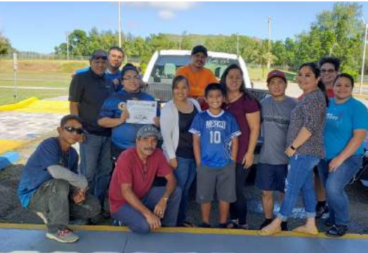
DMA assisting Adopt a school, Merizo Elementary. (Jan 2020)