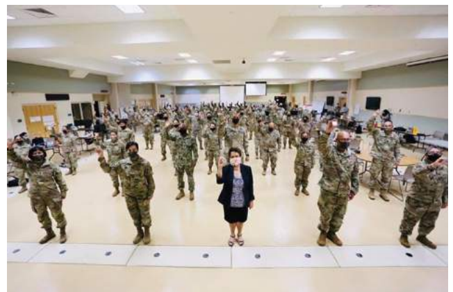
Commander-in Chief Lou Leon Guerrero with GUNG JTF-671. (July 2020)