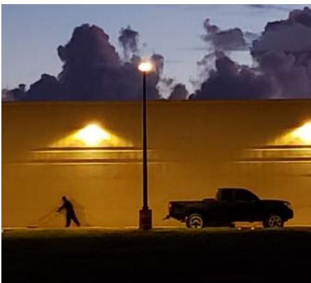
DMA Maintenance crew water blasting for GUNG event at 0530hrs. (Oct 2019)