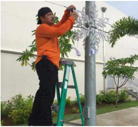
Maintenance Team at Skinners Plaza assisting with the Christmas lighting. (Nov 2019)

The DMA budget has had a large degree of variation due to federal projects and military capital construction. DMA's Military Capital Construction is also a source of funding variation and reflects the ability of the agency to effectively leverage and optimize the use of state funds.