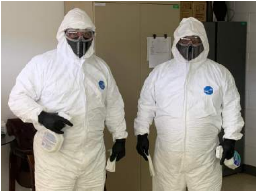
DMA Maintenance team geared up to sanitize CFMO after attending training by GUNG 93th Civil Support Team. (April 2020)