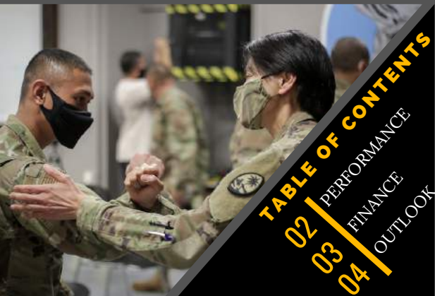
TABLE OF CONTENTS 02 PERFORMANCE 03 FINANCE 04 OUTLOOK

The Department of Military Affairs is a Government of Guam agency providing administrative and operational support to the Guam National Guard. With millions of dollars in Federal and State General Funds, the Department of Military Affairs through the Master Cooperative Agreement with the National Guard Bureau, ensures the Guam National Guard remains as a readiness force to serve the vital interests of the nation, the island, the local communities, and Guam's citizens.