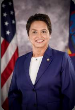
Lourdes Leon Guerrero I Maga-hagan Guahan Governor of Guam & Commander-In-Chief