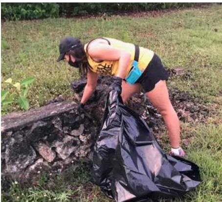
DMA and GUNG keeping Guam beautiful, Route 34 assigned area. (June 2020)