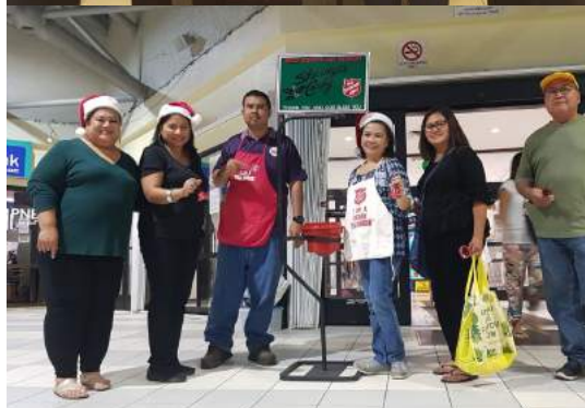
Team DMA, Adjutant General with Governor Leon Guerrero at Salvation Army Red Kettle campaign. (Jan 2020)