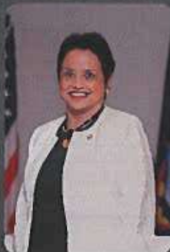
Lourdes Leon Guerrero Maga-hagan Gatahan Governor of Guam & Commander-In-Chief