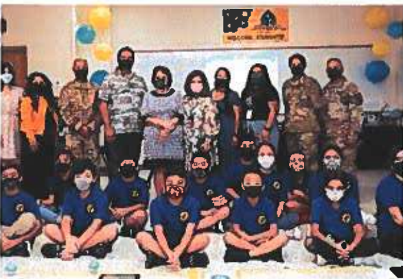
STARBASE Guam offers a positive, proven approach to engendering excitement and interest in Science, Technology, Engineering and Math (STEM).