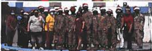
COVID-19 couldn't keep DMA and GUNG volunteers from coming together and bearing gifts for the children of Merizo Martyrs Memorial School. The Department of Military Affairs Adopt-A-School.