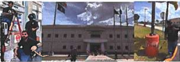
DMA Maintenance Team are always ready, willing and capable in supporting countless day to day building maintenance activities for both Government of Guam and in full support of our Guam National Guard.