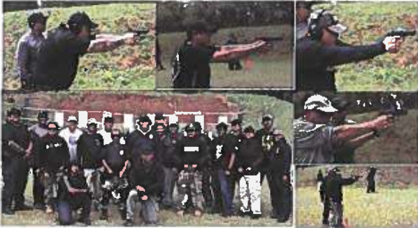
DMA Security Guards (Armed) are hands on and participating in weapons training, conducted by the Guam Police Department.

The Department of Military Affairs is a Government of Guam agency providing administrative and operational support to the Guam National Guard. With millions of dollars in Federal and State General Funds, the Department of Military Affairs through the Master Cooperative Agreement with the National Guard Bureau, ensures the Guam National Guard remains as a readiness force to serve the vital interests of the nation, the island, the local communities, and Guam's citizens.