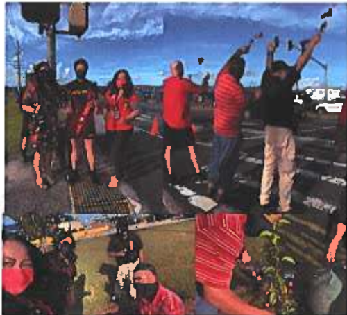
DMA and the Guam National Guard wore red, waved, and planted in support of Red Ribbon Week and Plant the Promise with special thanks to DOAG Forestry who provided the plants.