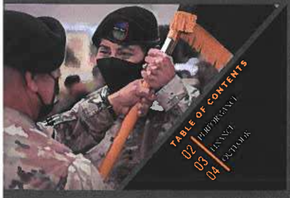
TABLE OF CONTENTS 02 PERFORMANCE 03 FINANCIAL 04 OUTLOOK