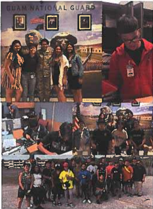
DMA hosted 10 participants of the Governor's Summer Youth Internship Program preparing and training them for real-work entry level experience, and mentoring them to be active contributing members of our island.