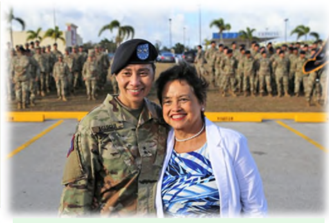
The first female Adjutant General, Major General (GU) Esther Aguigui with the first female Governor and Commander-in-Chief, the Honorable Lourdes Leon Guerrero