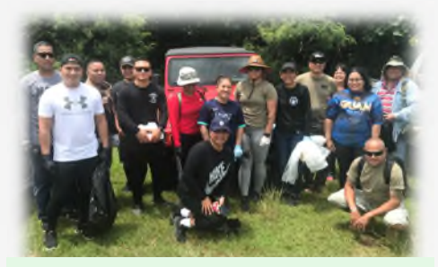
DMA and GUNG at Pagat's entrance in Ylgo, ready to clean as part of Lt. Governor's Island Beautification Task Force Projects