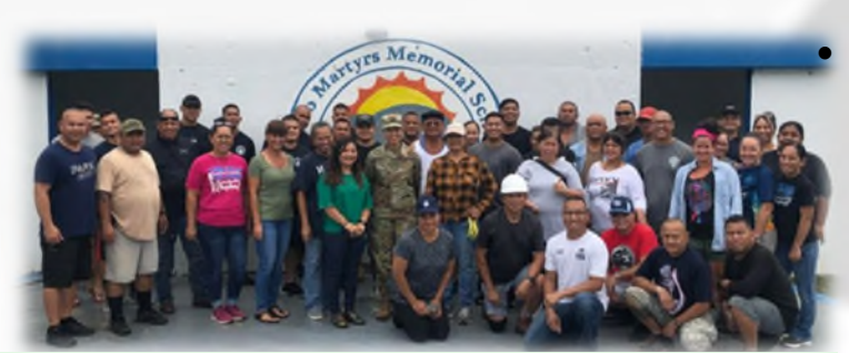
Merizo Martyrs Memorial School received assistance from DMA and GUNG. Adopt-A-School project included walls painted, electrical sockets repaired, trees pruned, hallways water blasted, white boards installed, and fence line maintenance..