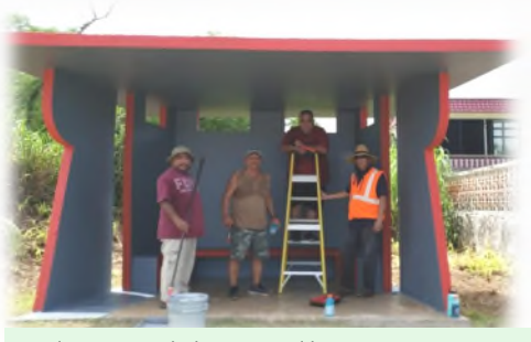
Adopt-a-Bus Shelter painted by DMA Maintenance.