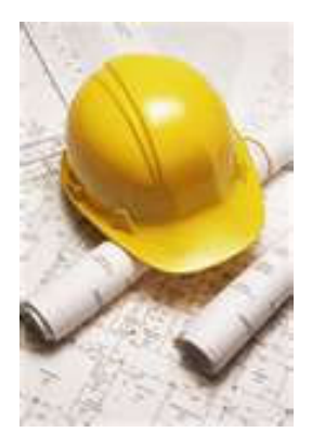
It's the Law

"No person within the purview of 21 GCA Real Property Chapter 70 shall act, or assume to act, or advertise, as a general engineering contractor, general building contractor or specialty contractor without a license previously obtained under and in compliance with this 21 GCA Real Property Chapter 70 and the rules and regulations of the Contractors License Board."