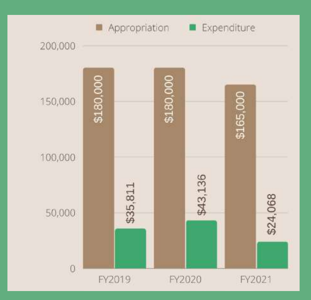
TASK FORCES FY19 - FY21