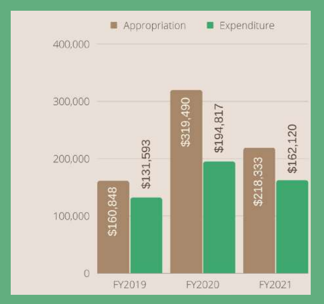
DIRECTOR'S OFFICE FY19 - FY21