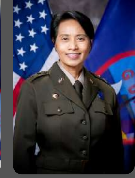
Lourdes Leon Guerrero I Maga-hagan Guahan Governor of Guam & Commander-In-Chief