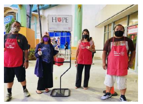
Team DMA volunteer to benefit the Army Red Kettle campaign.

Maintenance team and volunteers assist with the repairs, cleanup and preparation of DMA's Adopt-A-School, Merizo Martyrs Memorial School for the opening of the school year.