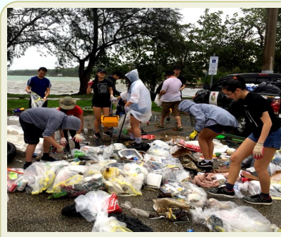
Inclement weather from Typhoon Manghut did not stop volunteers at clean-up sites. Efforts resulted in 5,369 volunteers and 1,196 pounds collected in debris. Site: Paseo, Hagatna.

The 24th Annual Guam International Coastal Cleanup (GICC) was postponed due to Typhoon Manghut. The data represents only the total number of volunteers and pounds in debris collected during the short period of time.