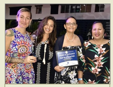
Awardees for Guam Year of the Reef 2018, MagPro Ceremony, UOG.