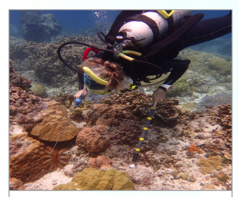
Collaborative partnerships continue with natural resource managers and local scientists for mitigation efforts with the Crown of Thorns (COTS) at Gun Beach, June 2018.

The Bureau of Statistics and Plans applied and received nine (09) grant awards totaling $16 million. BSP manages approximately $23 million in both new and active grants. USDOJ, NOAA and DOI grants are awarded for a 2 to 3 year grant period with 90% passed to subrecipients to implement criminal justice projects, coastal and environmental initiatives. The Census Grant will be used for recruitment, hiring, training, communications and outreach.