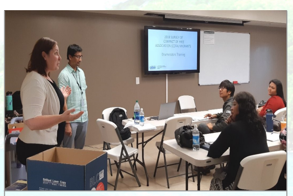
2018 Compact of Free Association (COFA) Enumeration Training. Enumeration results will provide official estimate of Micronesian migrants (FSM, RMI, and Palau) and their children residing in Guam. Site: University of Guam.