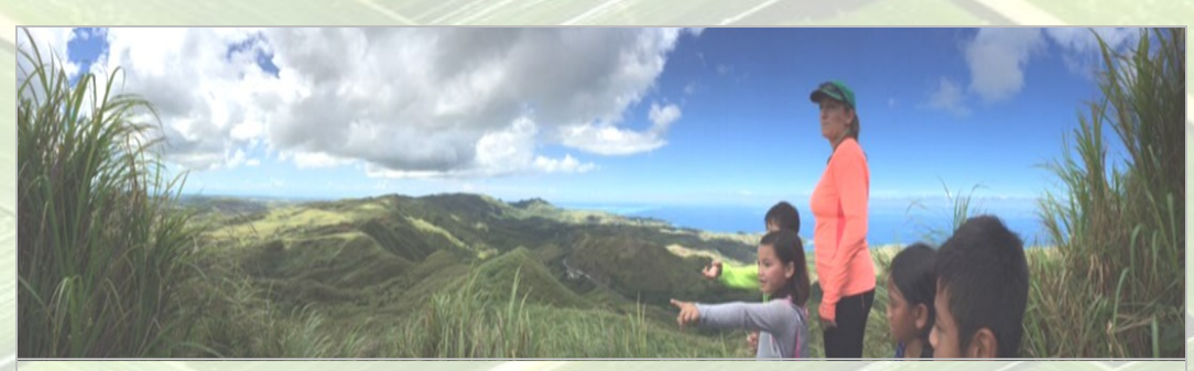
Kika Camp participants point out "badlands" or signs of erosion from the ridge of Humuyong Manglo while learning about impacts on coral reefs from erosion and wildland fires.