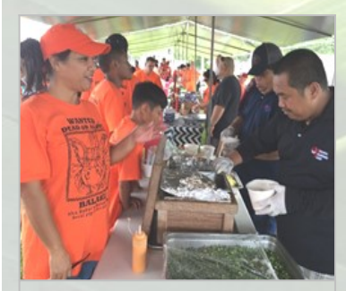
Pork In The Park Cook-off contestants present for tasting their culinary creations using pork from the pig hunting derby.

Guam Coastal Management Program located at 777 Rte. 4, Suite 5A, Phase II Complex, located in Sinajana (next to Civil Service Commission).