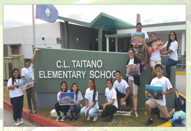
GWHS Guardians of the Reef conduct training with C.L. Taitano Elementary students regarding the importance of protecting Guam's coral reefs and how to prepare visual aids.