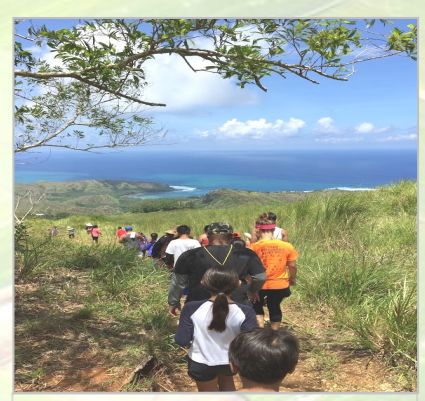
2015 Kika participants hike up Mt. LamLam as part of their ridge-to-reef experience to learn how erosion impacts Guam's precious habitats and marine resources.