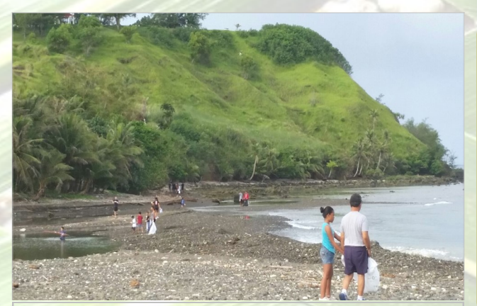
2015 GICC attracted 4,134 volunteers collecting 1,776 trash bags of 21,167 pounds of debris. Site: Umatac Bay

The FY 2015 Annual Report on the Impact of the Compacts of Free Association was completed. The cost for Guam to provide educational, public safety and health and welfare services to Freely Associated State citizens was $148,558,749 million.