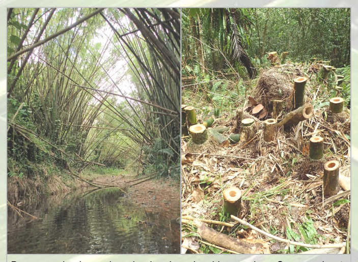
Bamusa vulgaris, an invasive bamboo, is widespread on Guam and outcompetes native vegetation. Heavy rains topple bamboo stands which dam up and cause streambank erosion, flooding, and property damage. The before and after removal pilot project at the Geus Watershed with herbicide application. Area will be replanted with native species, restoring forest and preventing sedimentation in the river.