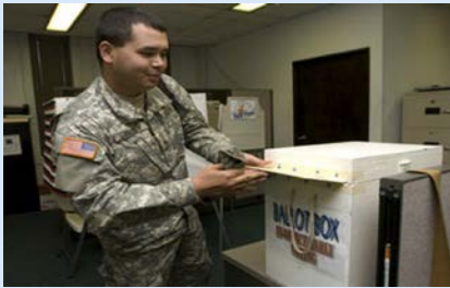
Local patriot casts his ballot early at the Hagåtña Guam Election Commission Office.