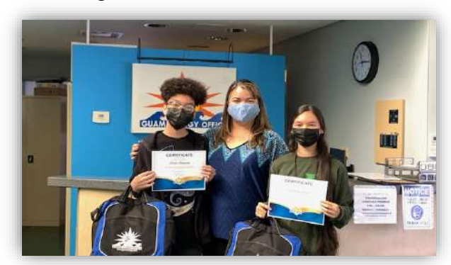
GEO Director and Summer Interns, 8/19/21