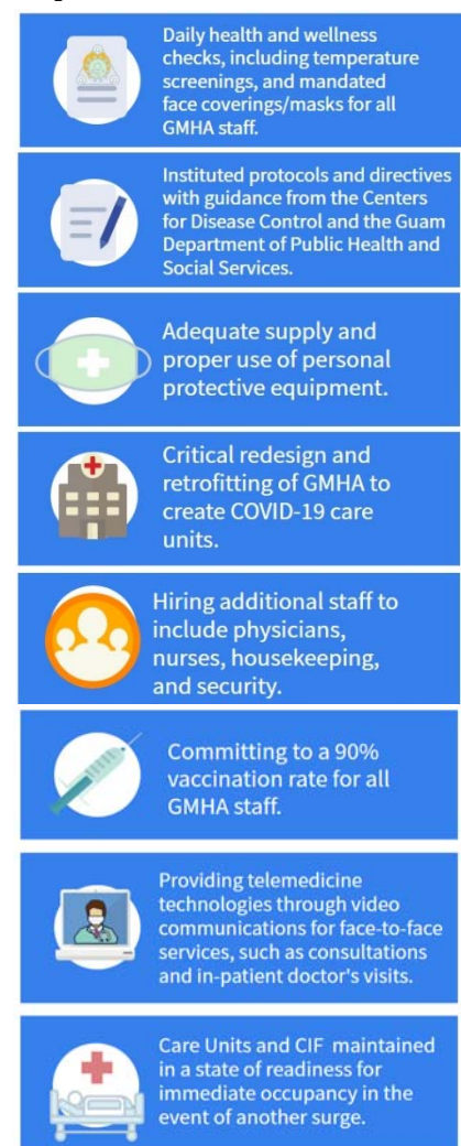
Image 1: GMHA COVID-19 Activities Implemented and Protective Measures

Net patient revenues decreased by $7.8 million (M) to $91.3M in FY 2020 due to increases in allowances for uncollectible accounts. GMHA’s patient/payer mix consists mainly of the 3M’s (Medicaid, Medicare, and MIP patients), third-party payers, and self-pay patients. Of the $177.7M in gross patient revenues, $66.0M were contractual adjustments based on costs