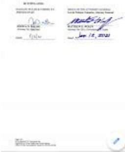
ST v. GSA, Stipulation To Continue, 1-12-21 (Page 2).jpg 63K