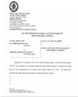
ST v. GSA, Stipulation To Continue, 1-12-21 (Page 1).jpg 88K