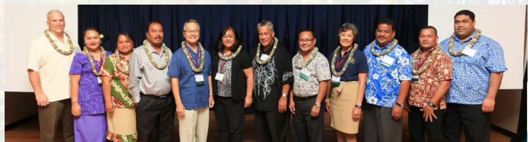
APIPA Principals and distinguished guests at the 2015 APIPA Conference.

We were pleased to host the 26 th Annual Association of Pacific Islands Public Auditors (APIPA) Conference in August 2015. Auditors and finance officers throughout Guam and Micronesia received valuable continuing professional education to help improve accountability and transparency and achieve good governance. The conference offered a wide range of ideas and courses, such as Audit, Government Finance, Grants Management, Leadership, and other courses to help professionals support and provide extended services to their organizations.