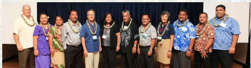
APIPA Principals and distinguished guests at the 2015 APIPA Conference.

We were pleased to host the 26 th Annual Association of Pacific Islands Public Auditors (APIPA) Conference in August 2015. Auditors and finance officers throughout Guam and Micronesia received valuable continuing professional education to help improve accountability and transparency and achieve good governance. The conference offered a wide range of ideas and courses, such as Audit, Government Finance, Grants Management, Leadership, and other courses to help professionals support and provide extended services to their organizations.