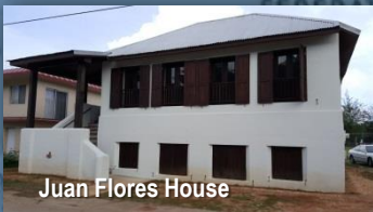
Juan Flores House