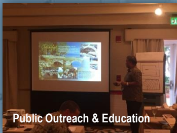
Public Outreach & Education