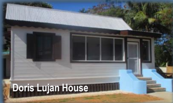
Doris Lujan House

The Guam Preservation Trust will preserve and protect Guam's historic sites, culture, and perspectives for the benefit of our people and our future.