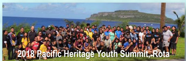
2018 Pacific Heritage Youth Summit, Rota

The Guam Preservation Trust presents its report as a testimony of the diligence and dedication of the Guam Preservation Trust Board of Directors, staff, and the preservation community in accomplishing this year's proposed outcomes and achieving the standards of success.