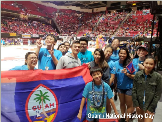
Guam / National History Day