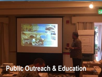
Public Outreach & Education