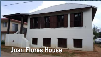
Juan Flores House