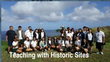
Teaching with Historic Sites