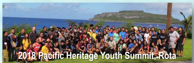
2018 Pacific Heritage Youth Summit, Rota

The Guam Preservation Trust presents its report as a testimony of the diligence and dedication of the Guam Preservation Trust Board of Directors, staff, and the preservation community in accomplishing this year's proposed outcomes and achieving the standards of success.