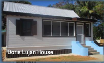
Doris Lujan House

The Guam Preservation Trust will preserve and protect Guam's historic sites, culture, and perspectives for the benefit of our people and our future.