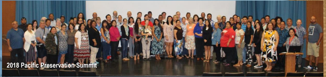
2018 Pacific Preservation Summit