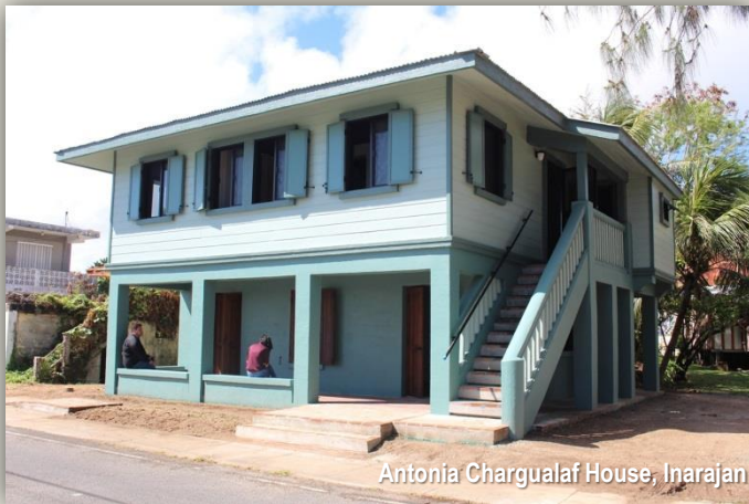
Antonia Chargualaf House, Inarajan