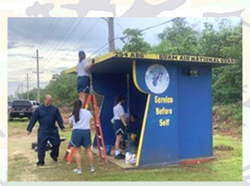
DMA and Guam National Guard helped spruce and paint a Bus Shelter .

On May 2018, the Guam National Guard held a fallen Heroes Memorial Ceremony for those who gave their lives serving their country and island.