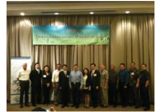
Taiwan Trade Mission