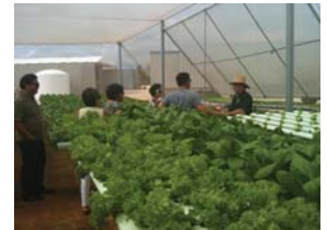
Grow Guam (hydroponic farm)