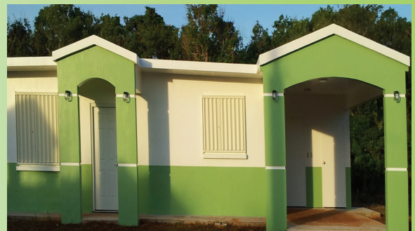
Photo: Renewal Homes, Dededo Constructed with HUD HOME grant funds

The Authority is governed by a seven member Board of Commissioners appointed by the Governor of Guam. GHURA has a current staff of 92 positions in eight divisions: Executive Management; Administration consisting of Fiscal, Human Resources, Management Information Systems, Procurement, and Audit and Compliance; Section 8 Housing Choice Voucher; Public Housing (Asset Management); Research, Planning, and Evaluation; Community Development; Architectural/Engineering; and Public Housing Capital Fund.