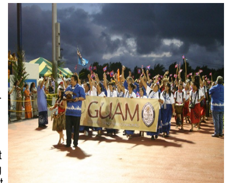
Guam Delegation—Opening Ceremony, 10th FESTPAC, 2008, American Samoa.

Through Public Law 30-83, the Guam Council on the Arts and Humanities Agency a.k.a. CAHA, along with other members of the 12 th Festival of Pacific Arts Coordinating Committee is responsible for: 1) The organization of committee and subcommittees for the implementation of programs and other work deemed necessary for the successful conduct of the 12 th Festival; 2) The preparation and execution of plans, programs and budgets requisite for the preparation for and successful conduct of the 12 th Festival; and the management of funds, equipment and other properties, appropriated loaned, contributed to and raised for the purpose of preparing and conducting the 12 th Festival of Pacific Arts in Guam in 2016. Guam will host the festival and will also be an active participant in all programming events. CAHA's primary responsibility for the 12 th Festival of Pacific Arts is two-fold: 1) to plan, develop and execute the programming for the event; and 2) to oversee Guam's official delegation participation at the festival. CAHA has been holding programming meeting every other month beginning November 2012.