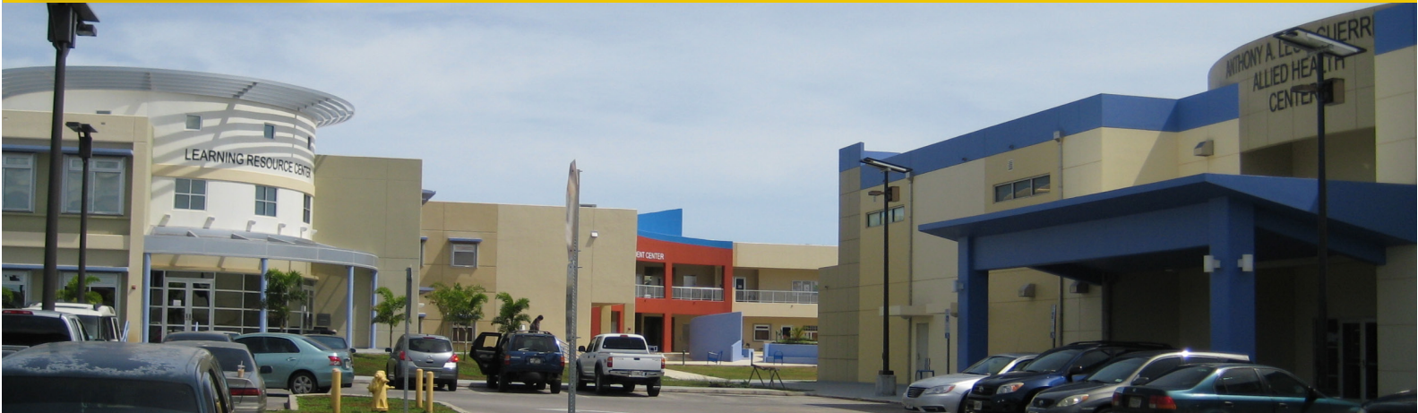
GCC has added three new buildings to its campus over the past three years: the Anthony A. Leon Guerrero Allied Health Center (right) in 2009, the LEED-Gold certified Learning Resource Center (left) in 2010, and its new Student Center (center) in 2011.