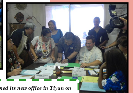
The Guam Ancestral Lands Commission opened its new office in Tiyan on July 1, 2011. A DEED Signing took place for Lot 238 Agat. Pictured here are GALC Staff Members and Commissioners, Governor Eddie Calvo and the Bordallo Family.